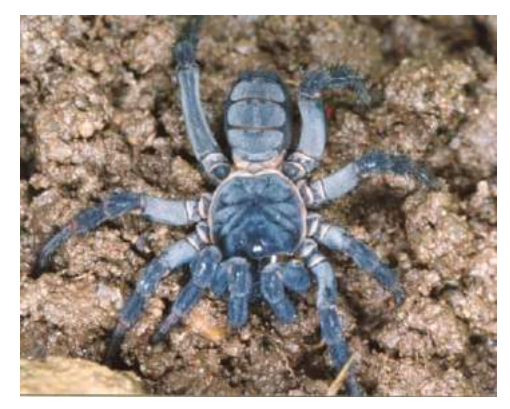
Fig.1. Vinathela cucphuongensis, female

Phylogenomic analysis of ultraconserved elements resolves the evolutionary and biogeographic history of segmented trapdoor spiders. Systematic Biology , 70(6): 1110-1122.