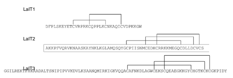
Fig. 1 Structures of LaIT1, LaIT2, and LaIT3

obtained. We will evaluate various bioactivities of LaIT3 using this synthesized peptide.