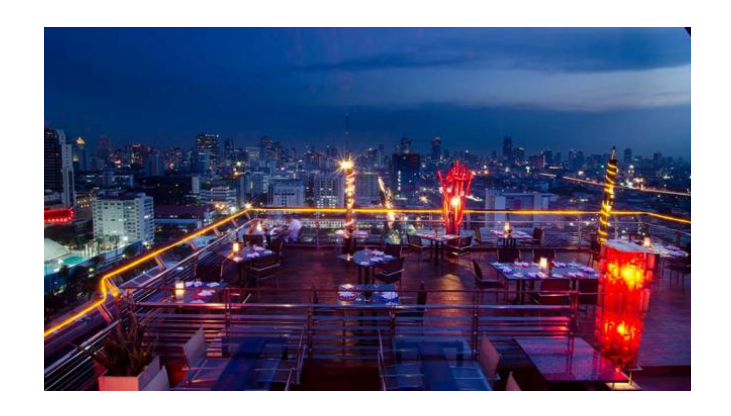
Novotel Bangkok on Siam Square (https://www.novotelbkk.com)

<u>Contact Address</u>: 392/44 Siam Square Soi 6, Rama I Road, 10330 Pathumwan Thailand, Tel: +66 2209 8888, Fax: +66 2255 1824, Email: h1031@accor.com