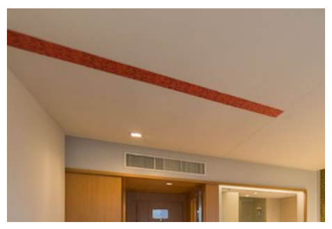
Siam@Siam Design Hotel Bangkok (https://www.siamatsiam.com)

<u>Contact Address</u>: 865 Rama 1 Road, Opposite National Stadium, Wang Mai, Pathumwan, Bangkok 10330, Thailand, Tel: +66 2217 3000, Fax: +66 2217 3030, Email: rsvn@siamatsiam.com