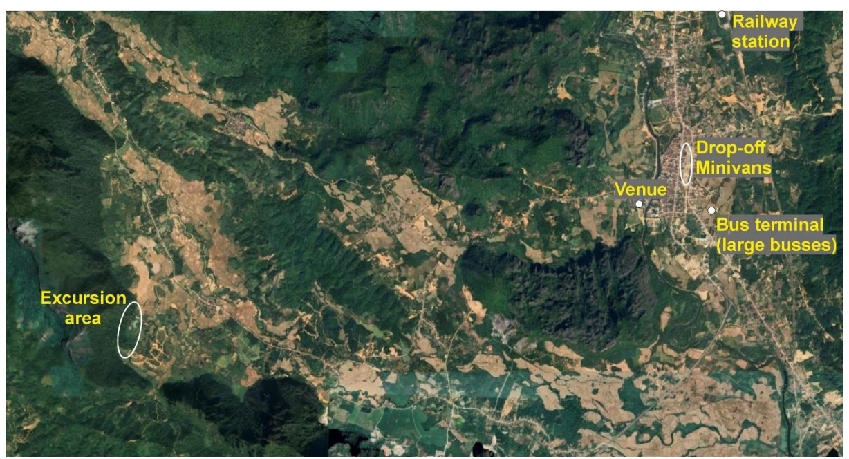
Vang Vieng with excursion area

take all registered participants to the spot after breakfast. Everyone is free to create their own programme. Two guides will accompany those who wish to explore the long cave (Tham Nang Oua Khiam; headlamps and water/snacks required). We plan to spend the whole day there, exchanging experiences about collecting methods and photographing spiders, or simply talking about our eight-legged friends. However, two Songthaews will be ready to take groups back to the hotel earlier if requested.