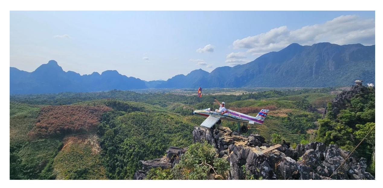
View Point with airplane