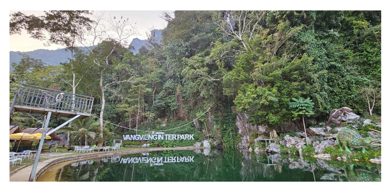
Lagoon in front of limestone cliff in Inter Park